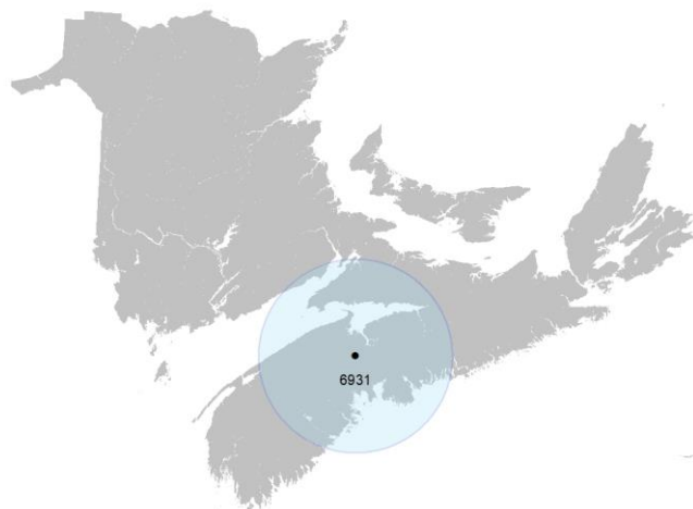
Map 1. A 100 km buffer around the study area